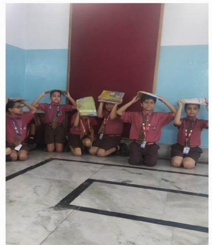
Earthquake Mock drill LFPS. YV. 3B